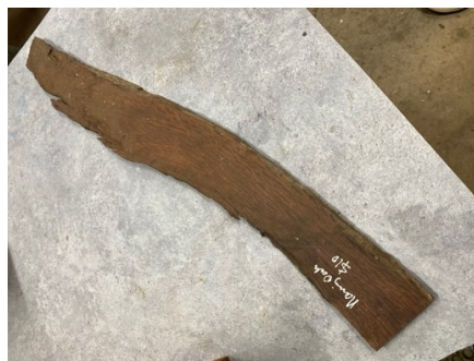
Pat picked up some items, timber and machines from a deceased estate.