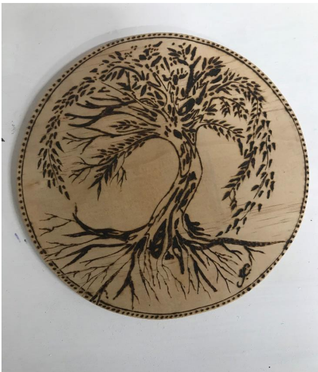
Yvonne has crafted a great chopping board and a couple of pieces of "Pyro Art"